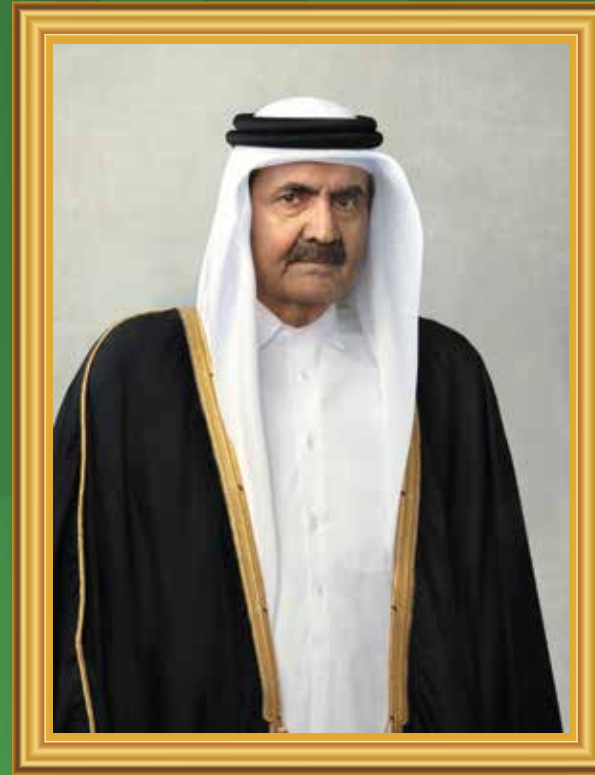
His Highness The Father Emir Sheikh Hamad Bin Khalifa Al-Thani