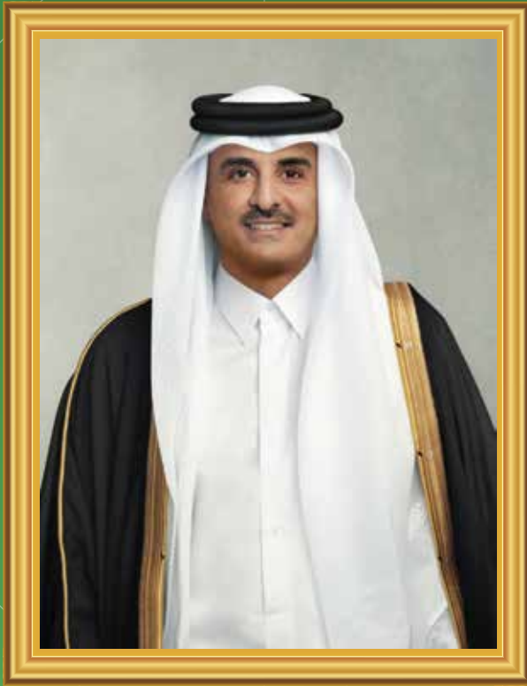
His Highness Emir of The State of Qatar Sheikh Tamim Bin Hamad Al-Thani